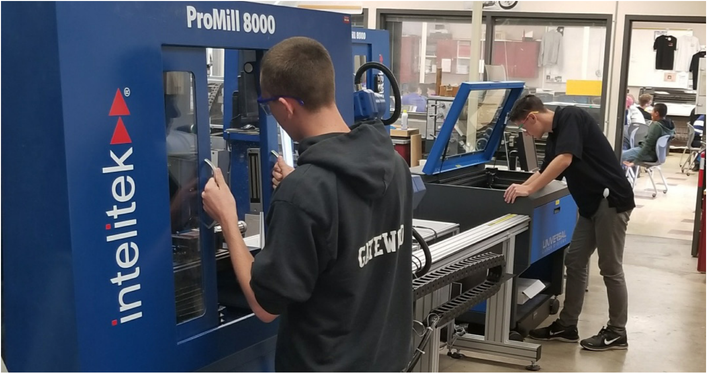
Students at Corona High School's STEM Academy work on the Computer Integrated Manufacturing lab hands-on program.

Integrated engineering program opens up opportunities for students