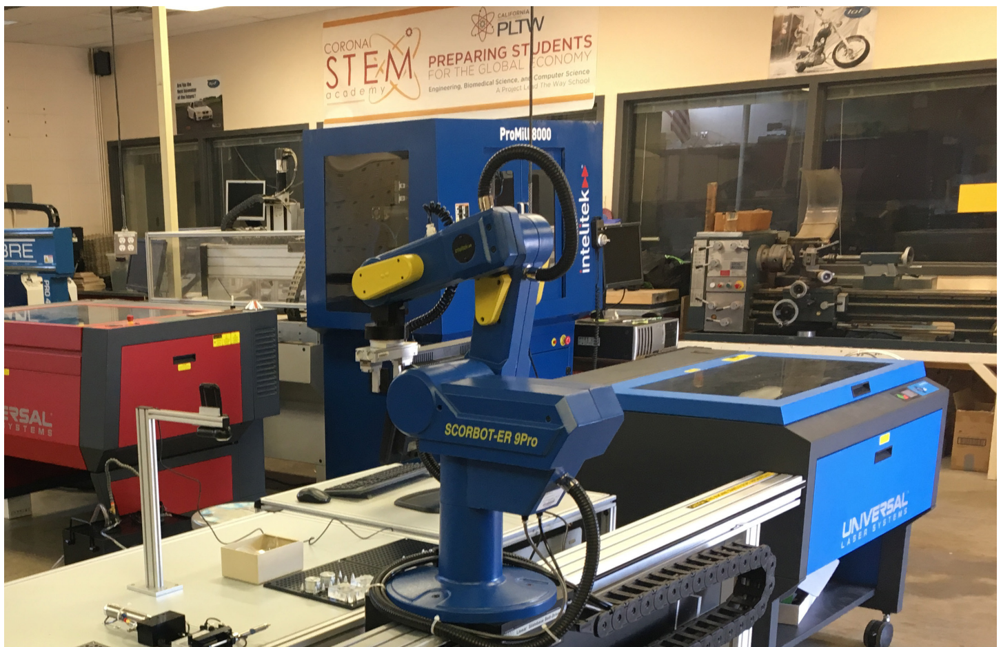
The PLTW Engineering Lab at Corona High School